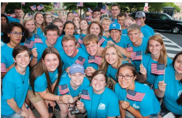
The Electric Cooperative Youth Tour delegates celebrate Flag Day following a tour of the White House.

In observance of Labor Day, our office will be closed on Monday, Sept. 4. Lane-Scott Electric wishes you a safe and happy Labor Day!